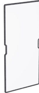
FlexBoard Pro L #70597

Light, magnetic white- and pinboard consisting of a fiberboard core made of fleece.