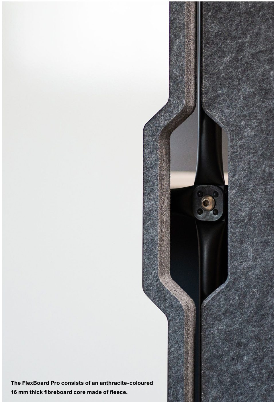
The FlexBoard Pro consists of an anthracite-coloured 16 mm thick fibreboard core made of fleece.