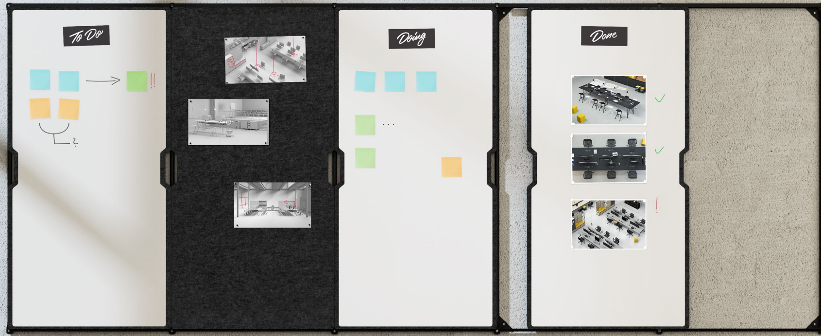
The WallRail Pro is mounted on the wall and can be extended as required.