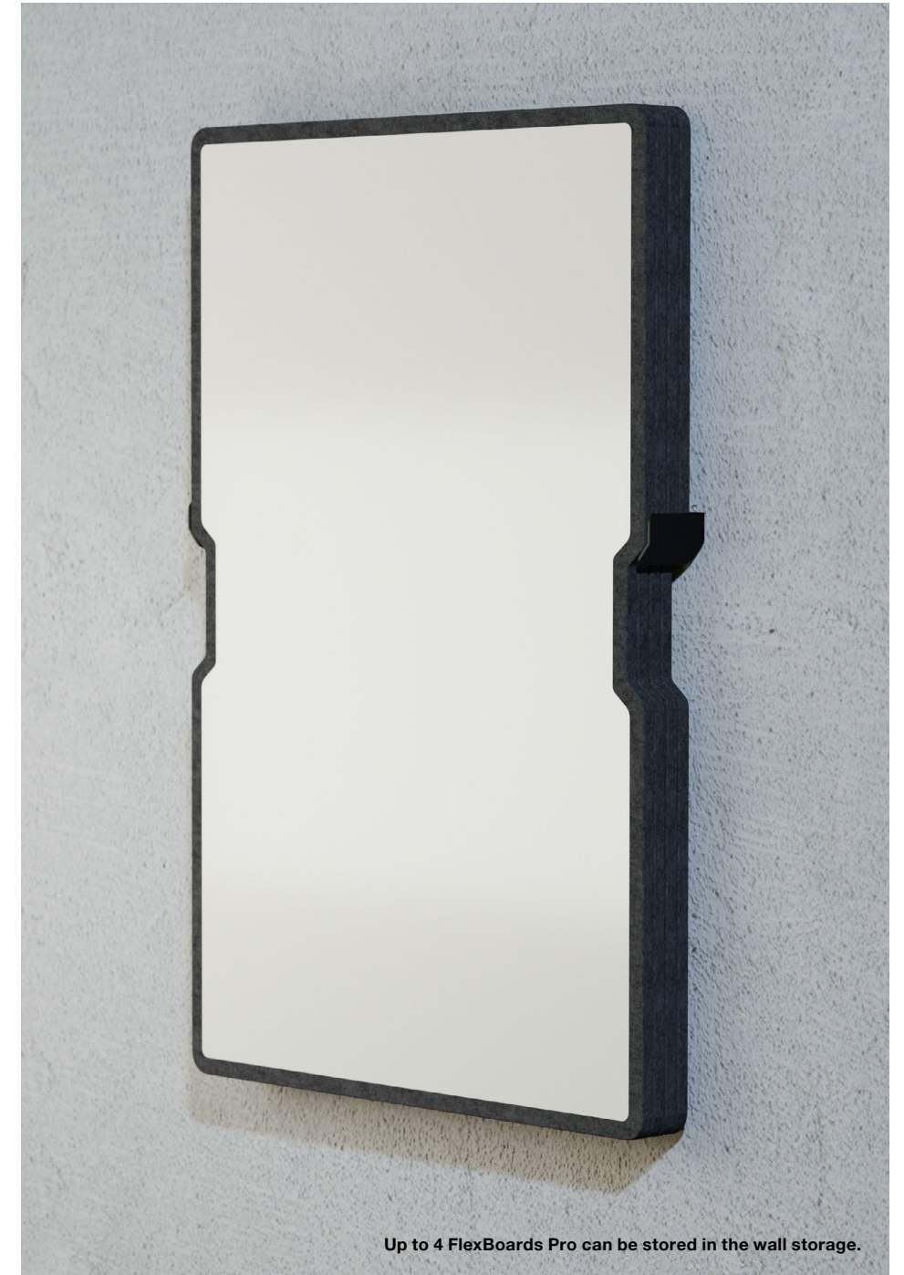
Up to 4 FlexBoards Pro can be stored in the wall storage.