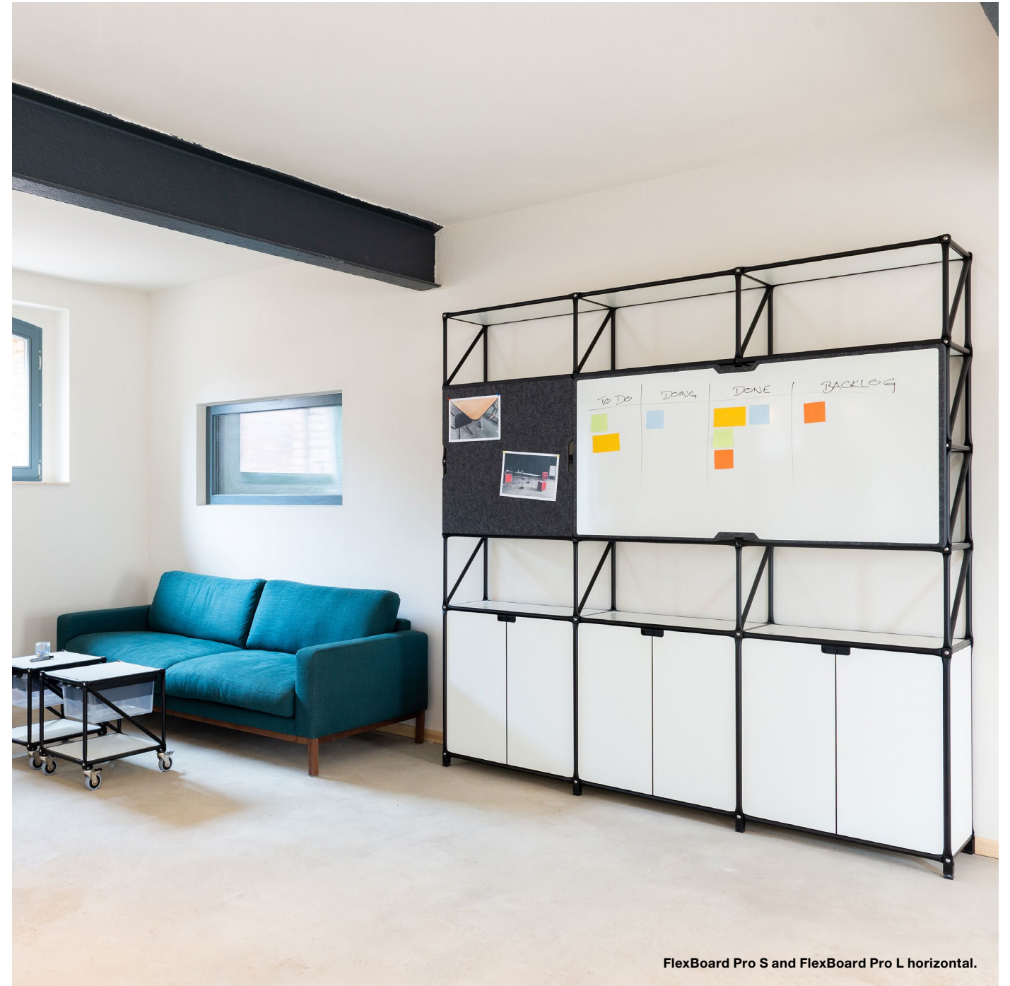
FlexBoard Pro S and FlexBoard Pro L horizontal.