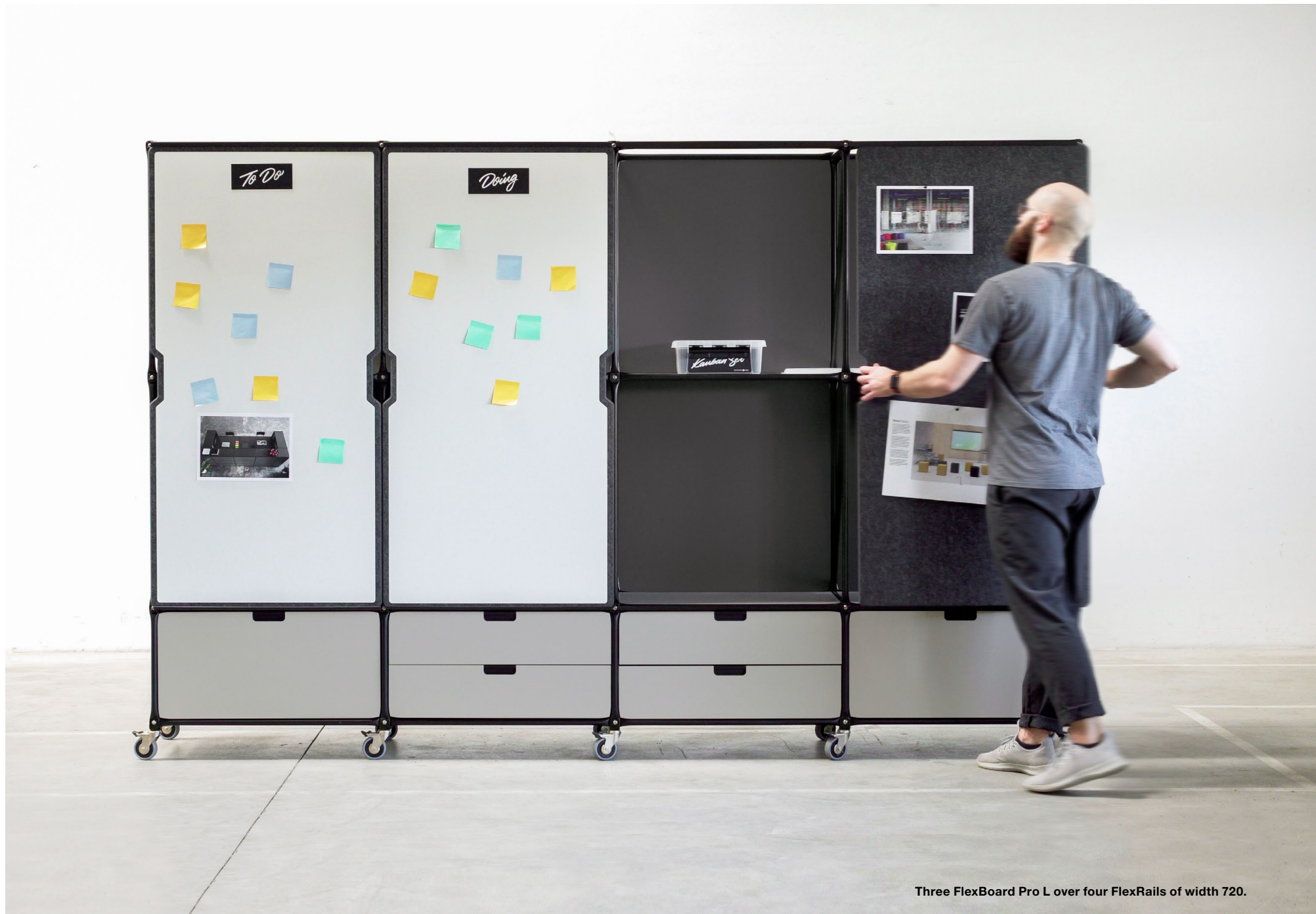
Three FlexBoard Pro L over four FlexRails of width 720.